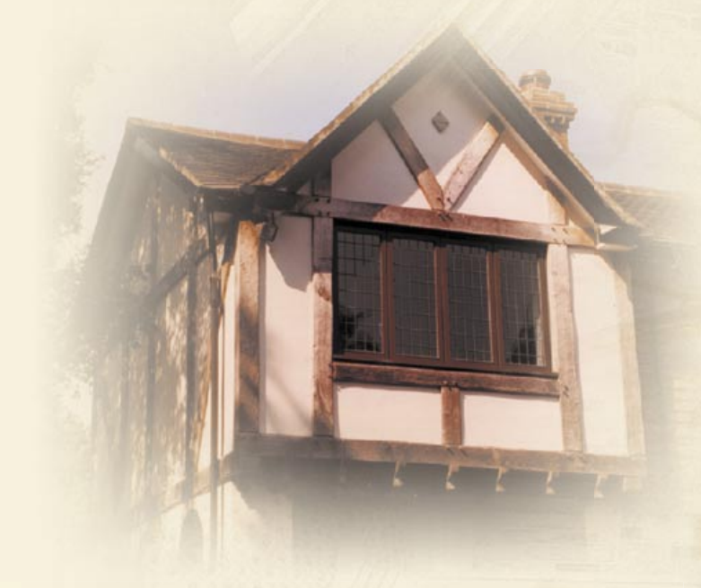
Originally built in the 1960s, this house has taken on a completely new ambiance following the addition of Oakmasters Tudor Cladding

These images display various examples of circumstances in which cladding has been successfully implemented.