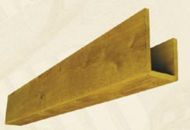
Uneven sides, fumed

Oakmasters' Beam Casings blend in with other solid oakwork