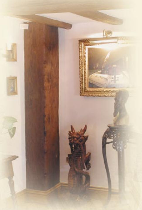
An upright Beam Casing covers unsightly pipes in this lounge